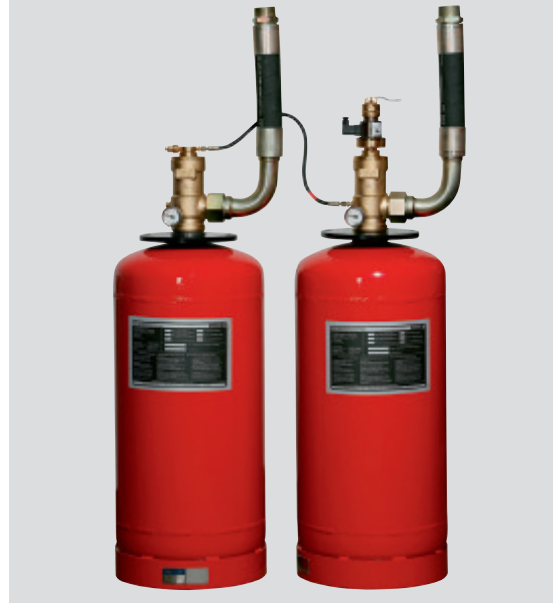
Example of a multi-cylinder system